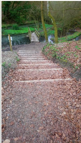
2021 following installation of steps