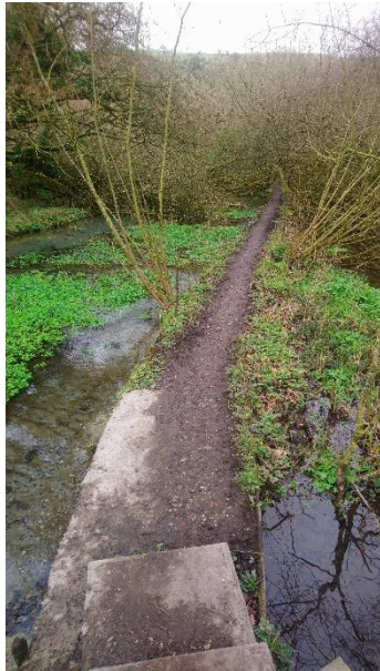
Mar 2021 showing clearance work