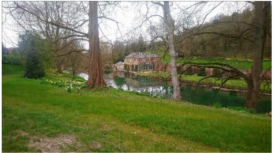
Mar 2021 view of Luccombe Mill