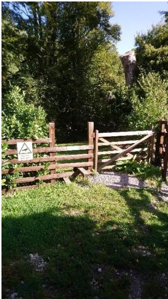
Sept 2020 route accessed via a stile