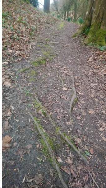
Mar 2021 exposed tree roots