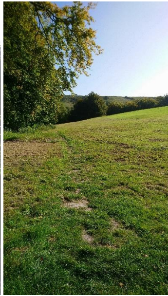
Sept 2020 view of Luccombe Down