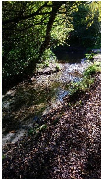
Sept 2020 paradise pool