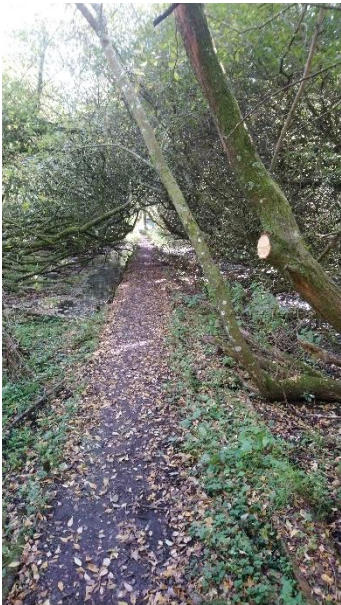
Sept 2020 watercress beds