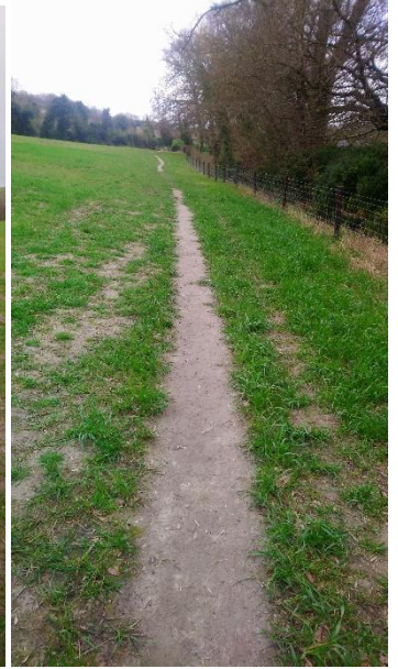
Mar 2021 walked route clearly visible