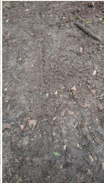
Mar 2021 bike tracks can be viewed in the surface of the footpath