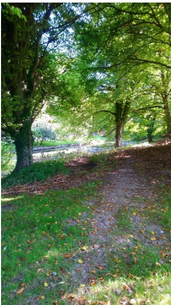
Sept 2020 showing the tree lined route along the mill pond