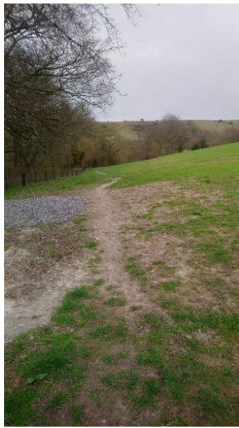
Mar 2021 to show condition following heavy rainfall