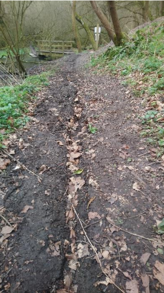
Mar 2021 surface condition