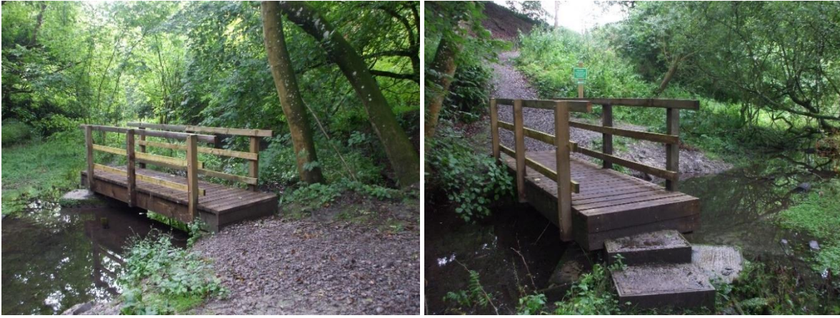
Sept 2020 the bridge is situated and the continuation point of the diversion