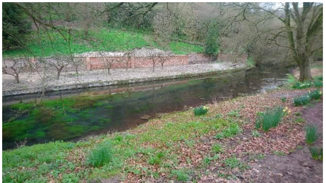
Mar 2021 and view of the mill pond