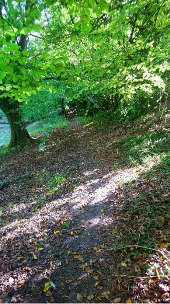
Sept 2020 camber of path