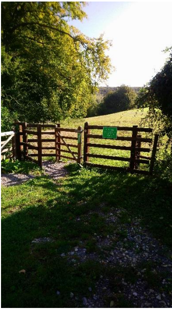
Sept 2020 access via a kissing gates