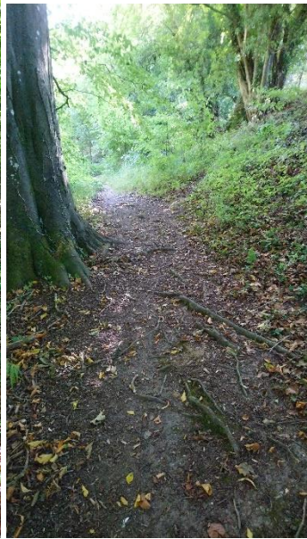
Sept 2020 exposed tree roots